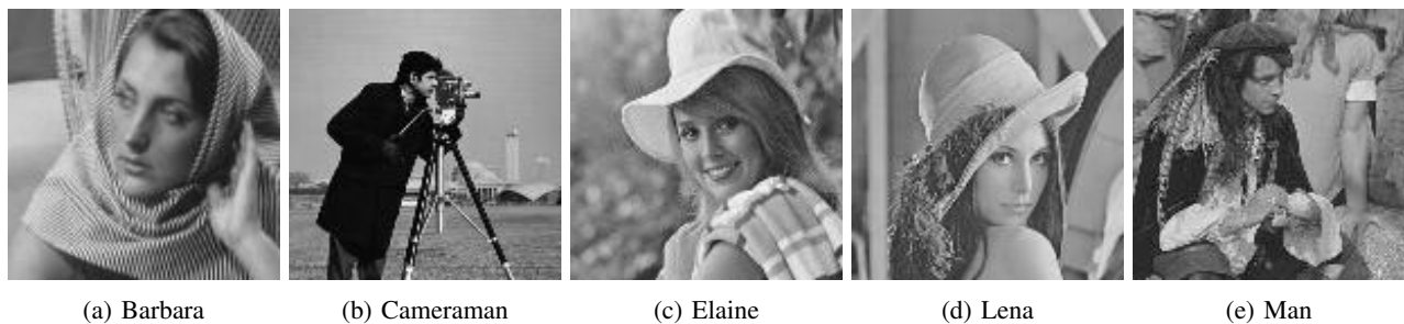
Fig. 1: Examples in the USC-SIPI Image Database