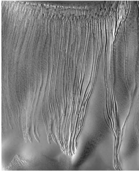
Figure 1. Linear gullies on the surface of a sand dune in the Russell crater on Mars. HIRISE image PSP_002904_1255 (25 cm/pixel). The image is 2 km wide.

water during the melting of snow and the interstitial ice [Larsson, 1982; Harris and Gustafson, 1993]. The melting of the active layer then represents the main source of liquid water. Debris flows are usually initiated when the critical shear stress is reached following the increase of fluid pressure within the weathered debris layer [Johnson and Rodine, 1984; Iverson, 1997]. Terrestrial studies also show that permafrost thaw can decrease the stability of hillslopes [Huscroft et al., 2003; Davies et al., 2001; Harris et al., 2001; Nelson et al., 2002; Pissart, 2005], particularly in the context of global warming. These climatic conditions could