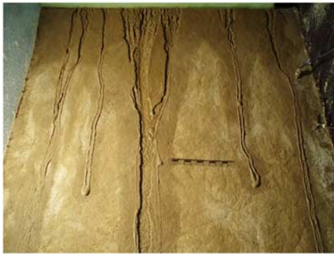
Figure 4. Narrow gullies with lateral levées and relatively small terminal lobes. The morphological characteristics of these gullies on silt are similar to those found in the Russell crater on Mars. The analogy with Figure 1 is striking. At the top sinuous channels occur on the rim crest. In the middle slope connections between gullies and the variation of their growth by successive waves of debris occur, resulting from several pulses of water from the rim crest.

linear gullies comparable to those seen on Mars (Figure 3). When active-layer thickness exceeded c. 5 mm, incision increases, resulting in a high quantity of transported material which then forms substantial accumulations (levées and terminal lobes). In this case, the large deposits inhibited the following flows which lead to the development of complex and non-linear gullies.